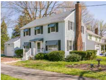
210 Seneca Rd 39 Showings, 11 offers. List Price $139,900, Sale Price $190,000