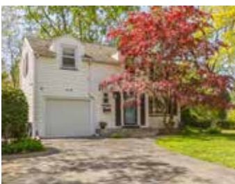
418 Brookview Dr 19 offers. 56 showings.