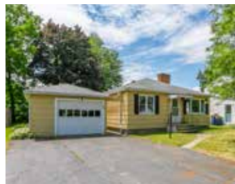
51 Traymore Rd 6 offers. 26 showings.