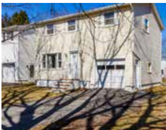
268 Wahl Rd 2 offers. 21 showings.