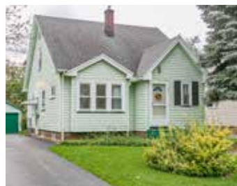
259 Seville Drive 5 offers. 18 showings.