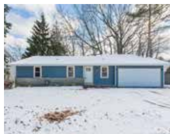
7 Ontario View 12 offers. 64 showings.