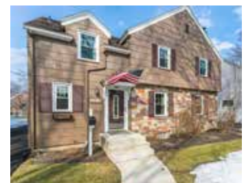
170 Thornton Rd 42 offers. 83 showings.