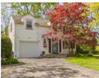
418 Brookview Dr 19 offers. 56 showings.