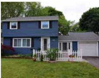
299 Coolidge Rd 8 offers. 42 showings.