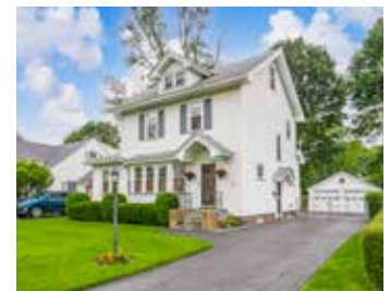
546 Westchester 7 offers. 8 showings.