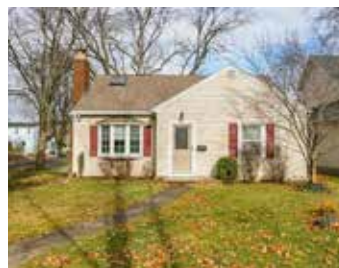
150 Garford Rd 3 offers. 17 showings.