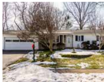
280 Lake Shore 9 offers. 55 showings.