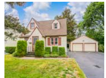
94 Winfield Rd 6 offers. 20 showings.