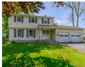
3985 Culver Rd 4 offers. 15 showings.