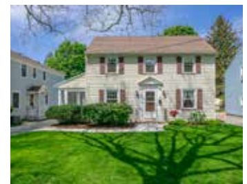
92 Seneca Rd 2 offers. 9 showings.