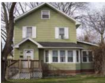
108 Brockley Rd 3 offers. 53 showings.