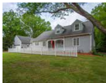
2727 Oakview Dr 7 offers. 8 showings.