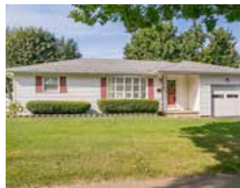
152 Fleetwood 5 offers. 18 showings.