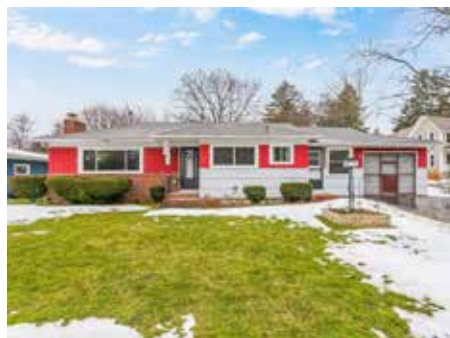
741 Helendale Rd 60 Showings, 21 offers. List Price $134,900, Sale Price $185,000