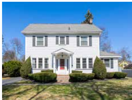
38 Barons Rd 32 Showings, 11 offers. List Price $199,900, Sale Price $308,500