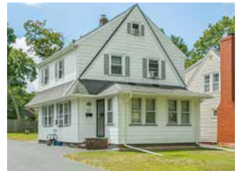
75 Pleasant Way 16 Showings, 3 offers. List Price $149,900, Sale Price $177,500