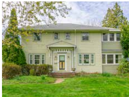
618 Lake Shore 29 Showings, 4 offers. List Price $169,900, Sale Price $206,500