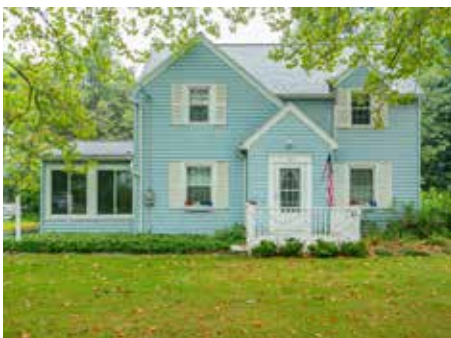
52 Seneca Rd 21 Showings, 11 offers. List Price $149,900, Sale Price $185,000