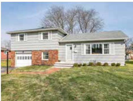
18 Weller Dr. 44 Showings, 17 offers. List Price $159,900, Sale Price $225,000