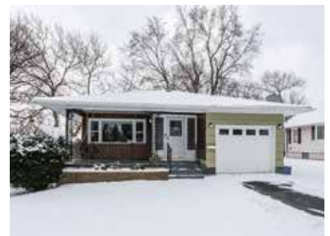
137 Heberton Rd 40 Showings, 5 offers. List Price $149,900, Sale Price $170,000