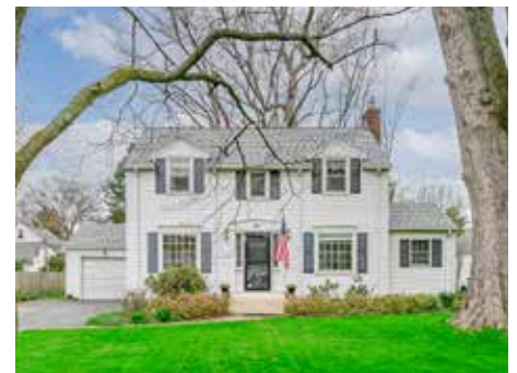
84 Suburba Ave 49 Showings, 20 offers. List Price $164,900, Sale Price $248,000